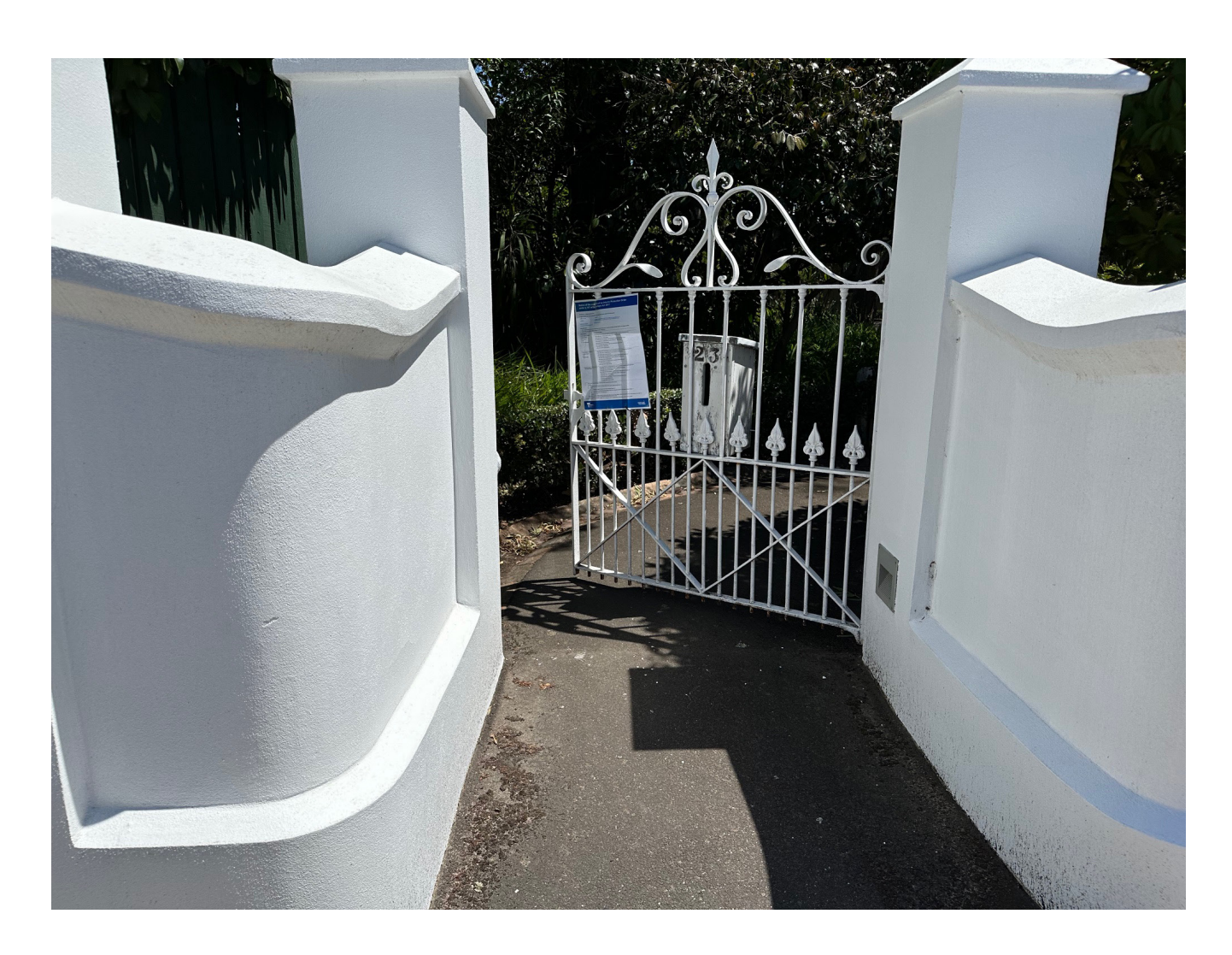
Photo showing Interim Protection Order on front gate of Halstead

https://www.planning.vic.gov.au/guides-and-resources/strategies-and-initiatives/activity-centres-program/moorabbin