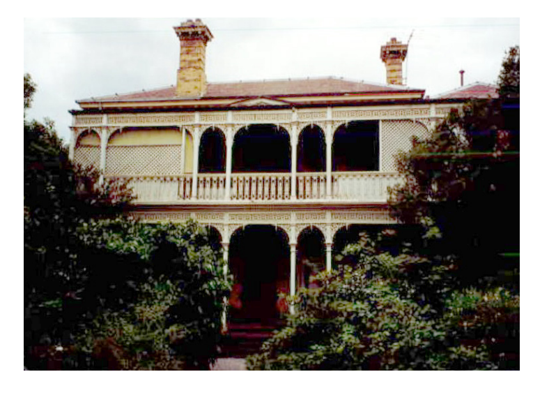
1994 photograph of Glenmoore (HO59) at 1 St Georges Road, one of the properties impacted by the Woolworths development.

You can view the plans and other documents here: