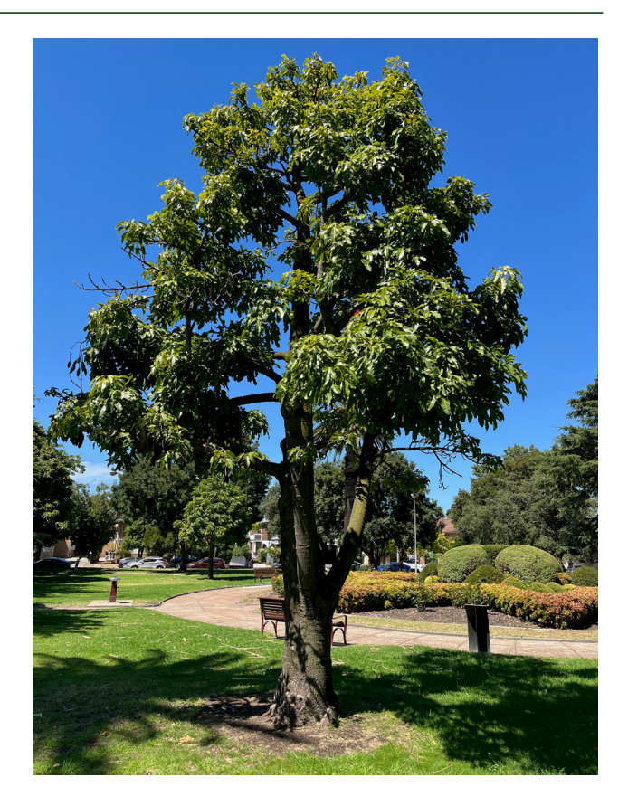
Flame Tree at Hopetoun Gardens (Photo GEHS February 2025)

Canary Island Date Palms ( Phoenix canariensis ) of varying ages were planted across the garden, often used as specimen trees in parks and